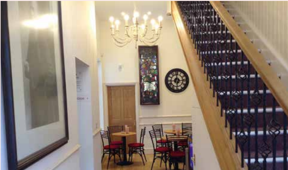
LET there be light. The entrance lobby of the association's headquarters has a solid oak floor, high ceiling and two sparkling chandeliers.