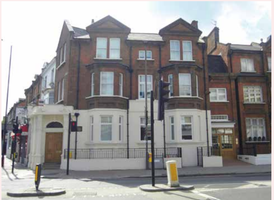
BANKING on success. Empty since the late 1990s, the SAGB's new premises – a former bank – have been extensively renovated inside and out.