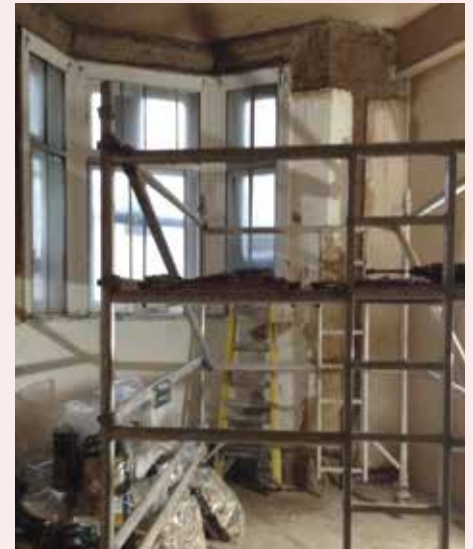
A TEAM of contractors worked "flat out" for twenty weeks to renovate the building.

many attractions, but most important to us is the location of the London Peace Pagoda, built by Japanese monks in 1985 to promote world harmony.