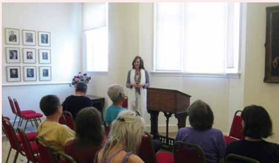
THE association's main auditorium is named after another Spiritualist pioneer, William Stead. Seen right, a bust of him was a gift to the SAGB.